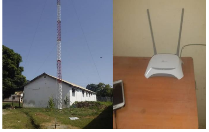
23 Sept 2020, cell tower and internet connection at Mile 2

On 23 September the project completed the installation of a cell tower providing much needed internet access to the Mile 2 Central Prison and the Prison Service Headquarters. This will facilitate the participation of inmates in the Virtual Courts and increase remote access to legal aid.