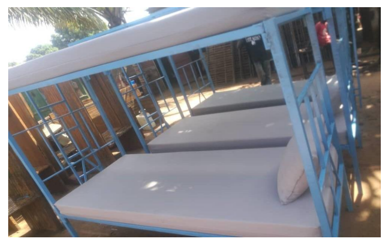
Bunk beds for the Prison Service

GCCI is also supporting the rehabilitation of the medical facilities and kitchens at Mile 2 and Jeshwang Prisons.