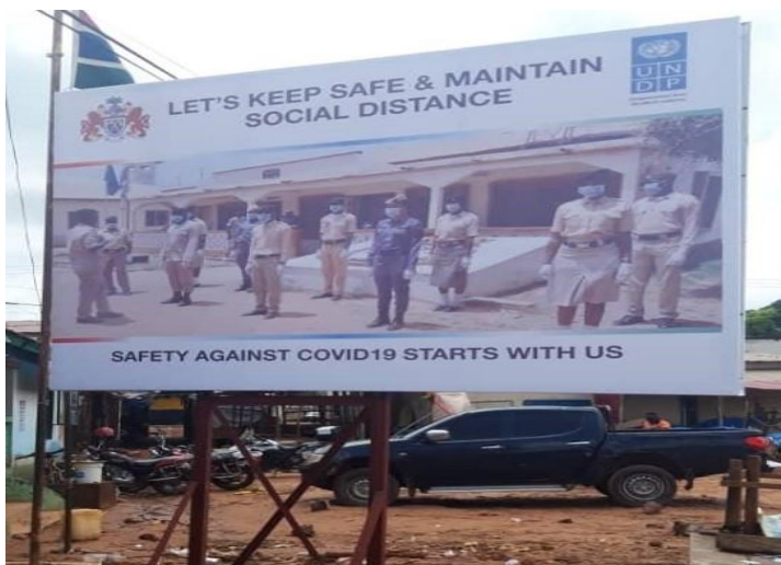
13 Sept 2020, Basse community

On 13 September 2020, billboards for the Prison Service and Police Force were erected in Basse (Upper River Region) and London Corner (West Coast Region) to raise awareness and sensitize the public on safety measures under COVID-19.